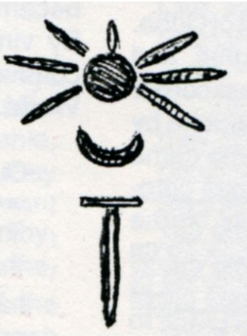
Godess Innana (Dilmun)