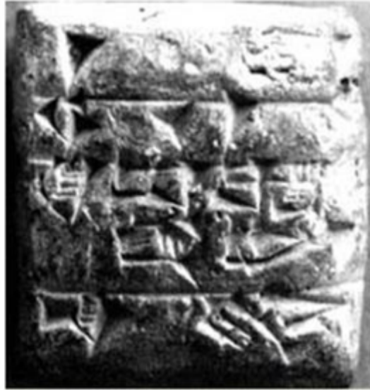
Chief Joseph's Cuneiform Tablet