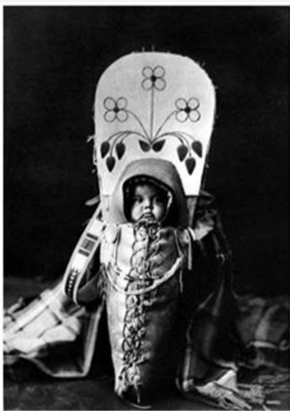
Nez Perce Baby 1911,