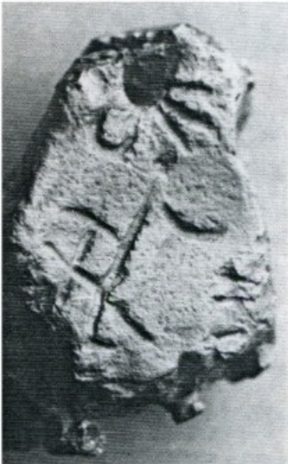
The Shawnee Creek Stone (Oklahoma, U.S.)