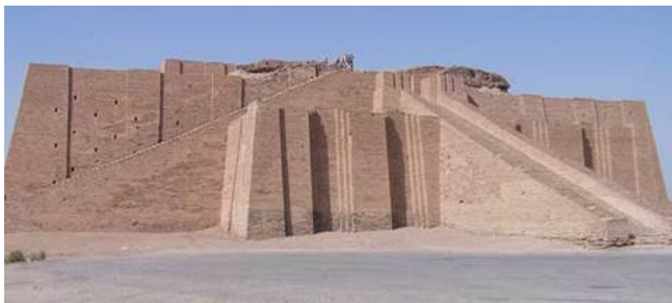
Neo Babylonian Ziggurat

Because the Adena culture began around 1000BC and the tower of Babel dated to 2000BC. I'm going to assume the original settlements of the Brother of Jared have not been found. According to scripture the brother of Jared landed the eight circular boats in what would now be Lake Ontario. The boats as described in the scriptures were light upon the water. In this way the boats must have been blown up the St Lawrence Seaway to Lake Ontario.